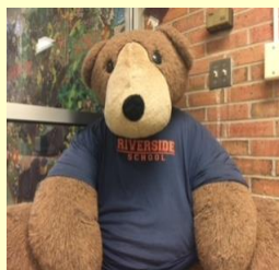
Home of Riverbear!